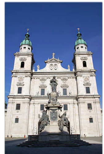
Salzburg Cathedral, Austria

Schonbrunn palace is one of the grandest imperial palaces in Europe and the world. We enjoy a tour of the palace and the gardens. We return to our hotel in the early afternoon and will meet for a group dinner at a local restaurant this evening. [B, D]