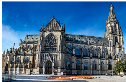
Linz Cathedral, Austria