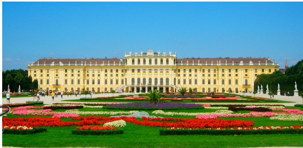
Schonbrunn Palace, Vienna