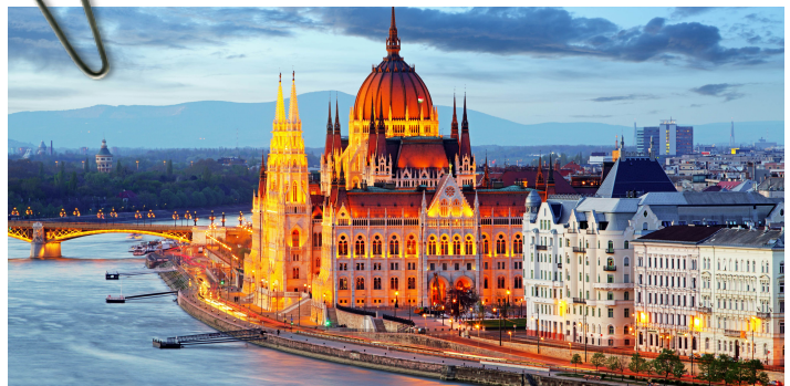
Castle District of Budapest