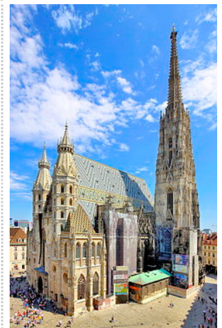
St. Stephens Cathedral, Vienna