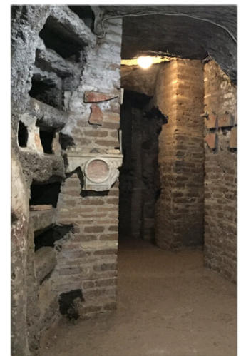
Catacombes in Rome

This morning we will have a guided tour of the Museum that houses Michelangelo's famous sculpture of David. We enjoy a tasty lunch together where we sample local specialties, and wine of course. The rest of the day is at your leisure to enjoy this incredible city. [B, L]