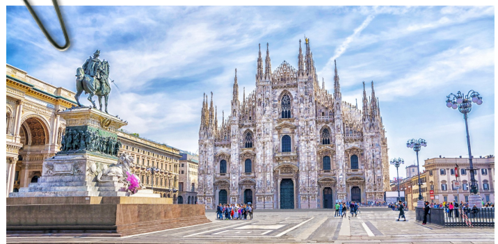
Milano Duomo & Plaza

Following breakfast, we will load our coach and journey to Milano's famed opera house: La Scala, where we enjoy a tour. The afternoon is free time for you to enjoy at your leisure. There are wonderful shopping and dining opportunities by La Scala. We gather this evening at our hotel restaurant, and enjoy dinner together as a group. [B,D]