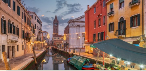
Canal in Venice