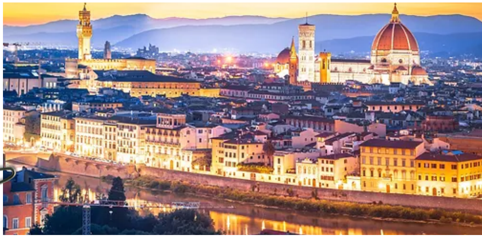
Florence at dusk