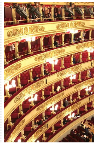
La Scala, Milano