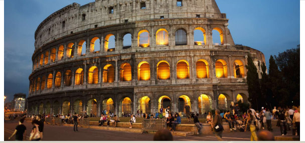
Colosseum in Rome