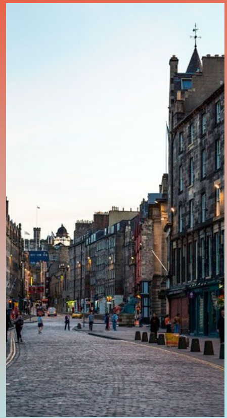
Royal Mile, Edinburgh

DAY 5 - Enjoy a free day in Edinburgh. This evening we join together for dinner and a show that celebrates Sottish traditions. Tomorrow morning we bid farewell to Edinburgh, and depart for St. Andrews so please pack and plan accordingly. [B, D]