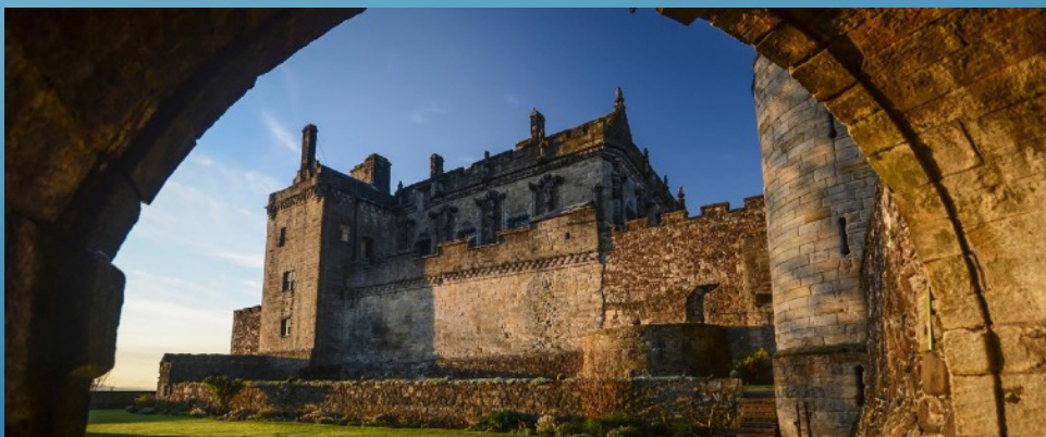
St. Andrew's Castle