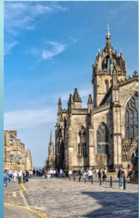
St. Giles Cathedral