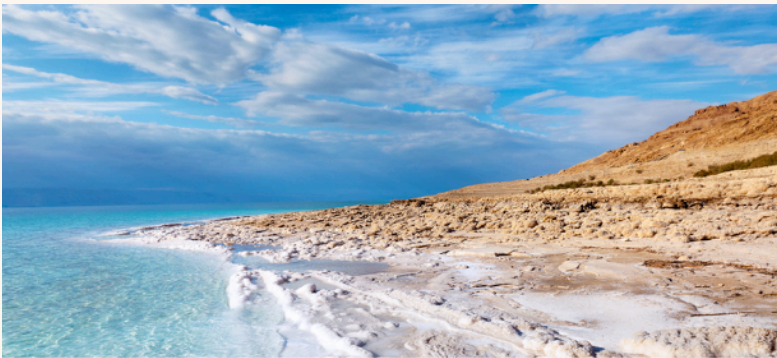
THE DEAD SEA

At 8am, our coach-driver will take us to the Dead Sea Basin where we will visit Qumran to explore the area where the Dead Sea sect established a community and we'll see the caves where the Dead Sea Scrolls were found. We'll drive to Masada and ascend this wilderness mountain fortress in a cable car; walk through the remains of the palace, water cisterns and fortifications built by King Herod and hear about the Zealots who lived here until the bitter end. There is a food court at Masada where we will have lunch. Bring a swim suit if you want to float on the Dead Sea. We will celebrate our tour with a group dinner at our hotel restaurant at 6pm. [B,L,$20,D]